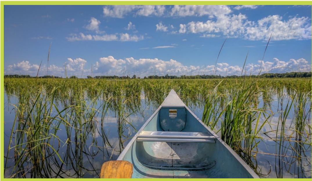
Wild rice growing in Kathio State Park, MN.