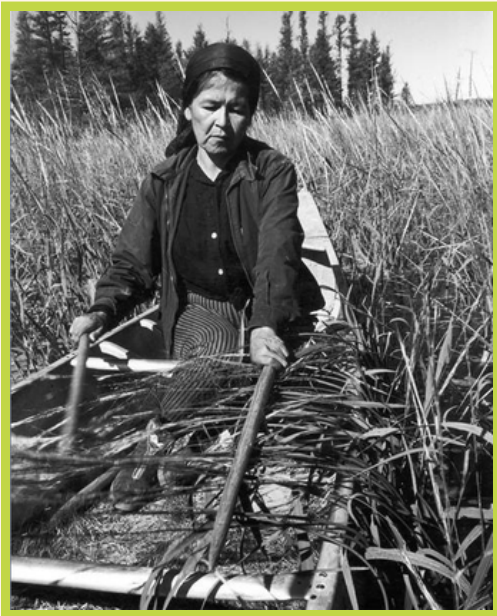
A woman in northern Wisconsin harvests and knocks wild rice off the stems into her canoe using traditional harvesting sticks.

Indigenous Peoples are integral to the climate justice movement. Their knowledge + practices teach us that collective environmental justice + liberation is possible but not without Indigenous leadership.