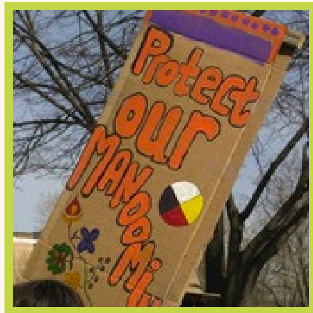
Rally at State Capitol - May 2011