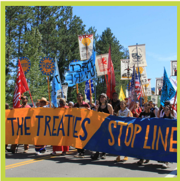
Indigenous leaders + community allies marched on June 7th, 2021, in Clearwater County, Minnesota. In protest of Enbridge pipeline at the Mississippi River's headwaters, the day's actions called on the Minnesota state officials and the Biden administration to honor Anishinaabe treaty rights.

Treaties serve as a foundation for establishing Indigenous rights.