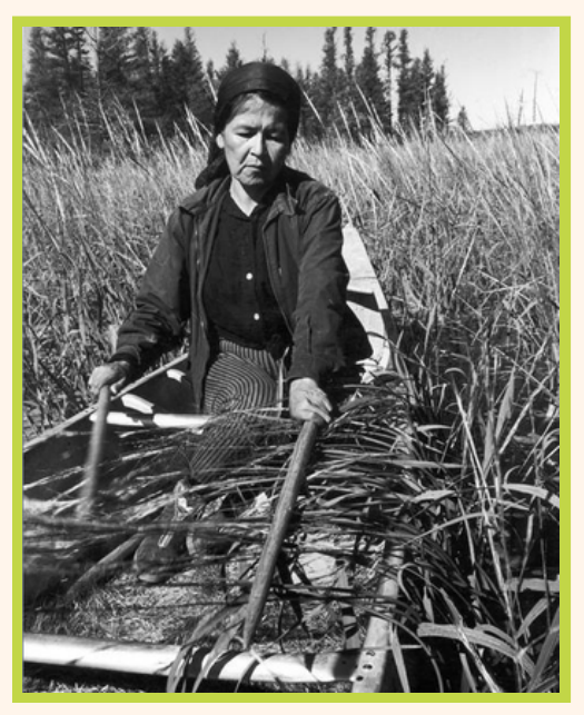
A woman in northern Wisconsin harvests and knocks wild rice off the stems into her canoe using traditional harvesting sticks.

Indigenous Peoples are integral to the climate justice movement. Their knowledge + practices teach us that collective environmental justice + liberation is possible but not without Indigenous leadership.