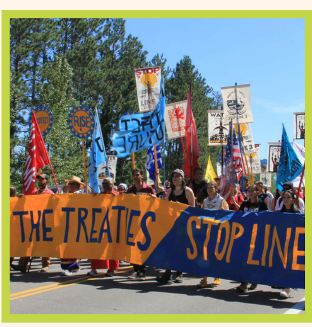
Indigenous leaders + community allies marched on June 7th, 2021, in Clearwater County, Minnesota. In protest of Enbridge pipeline at the Mississippi River's headwaters, the day's actions called on the Minnesota state officials and the Biden administration to honor Anishinaabe treaty rights.