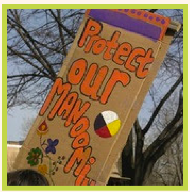
Rally at State Capitol - May 2011