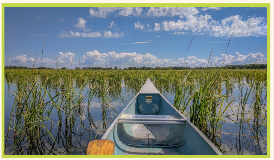
Wild rice growing in Kathio State Park, MN.

• Recognizing the rights of the specific cultural resources reinforces the sovereignty of Inidgenous Peoples and honors Treaty rights recognized in 1825, 1837, 1854, and 1855 Treaties with the Chippewa and US government. (Rights of the tribe to gather Manoomin + other aquatic plants from public waters on Treaty land)